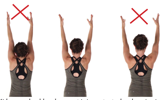
Mid-range shoulder placement is important when hanging in the air. The trapezius muscle does most of the work here.

This is a great exercise to do on the ground to allow your brain to connect with your shoulders and check in. You should always be aware of how you are holding your shoulders. Too much engagement and they become locked up, putting too much pressure on the joint. Too little engagement and the muscles hand off the job of engagement to tendons and ligaments which can easily tear. Much of aerial is devoted to finding the right shoulder placement to prevent injury. Other sports use the term "shoulder packing" to describe this process of properly placing and engaging the shoulders in the right amount to maximize efficient movement while minimizing shoulder injury. Keep questioning. Keep learning. Keep studying. There's too much to cover in this book alone.